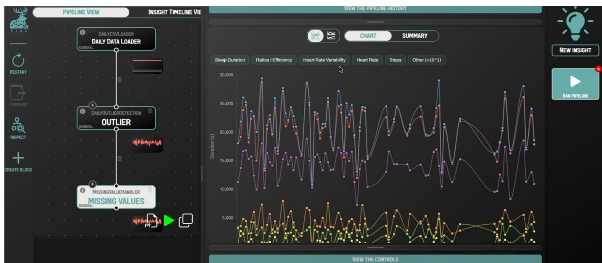
Figure 1 STAG used by a UZH expert for time series missing value imputation for multivariate sensor data

The primary objective of the STAG project is the design and development of a modular interactive framework that supports health researchers in constructing, refining, and documenting preprocessing pipelines for time series data in a transparent and reproducible way. The system enables users to iteratively explore and process complex, multimodal time series data while maintaining a clear record of all transformations, parameter choices, and user decisions. A central outcome is the automatic generation of structured analysis protocols, which improve consistency, traceability, and comparability across studies and research groups. The framework combines visual interfaces with a pipeline-based architecture, allowing users to inspect intermediate results, compare alternative processing strategies, and adapt workflows to specific research questions. STAG further demonstrates that integrating data handling, modeling steps, and user reasoning within a single system reduces manual effort and supports systematic hypothesis generation. The project establishes a reusable infrastructure that facilitates collaboration between domain experts and data scientists and enables the transfer of validated preprocessing strategies across applications such as clinical and longevity research and health monitoring.